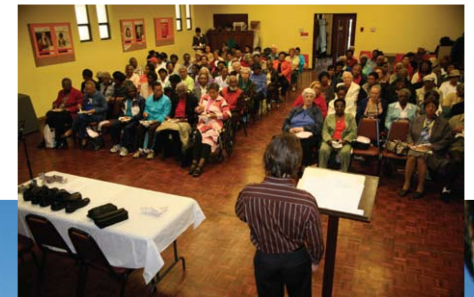
Senior Foot Care Seminar

This significant contribution to our elderly community is an example of our commitment to taking residential care to a higher level and reflects our dedication to providing long term support to our aging population.