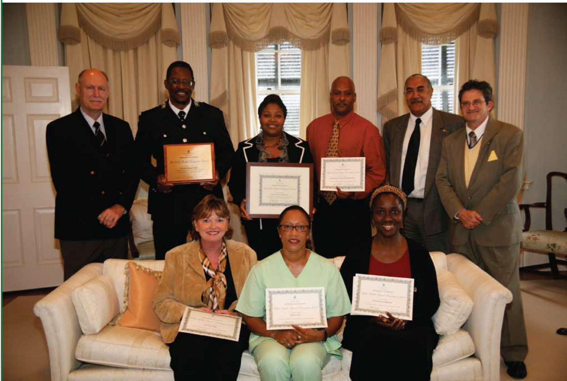
2006 Health Award Recipients