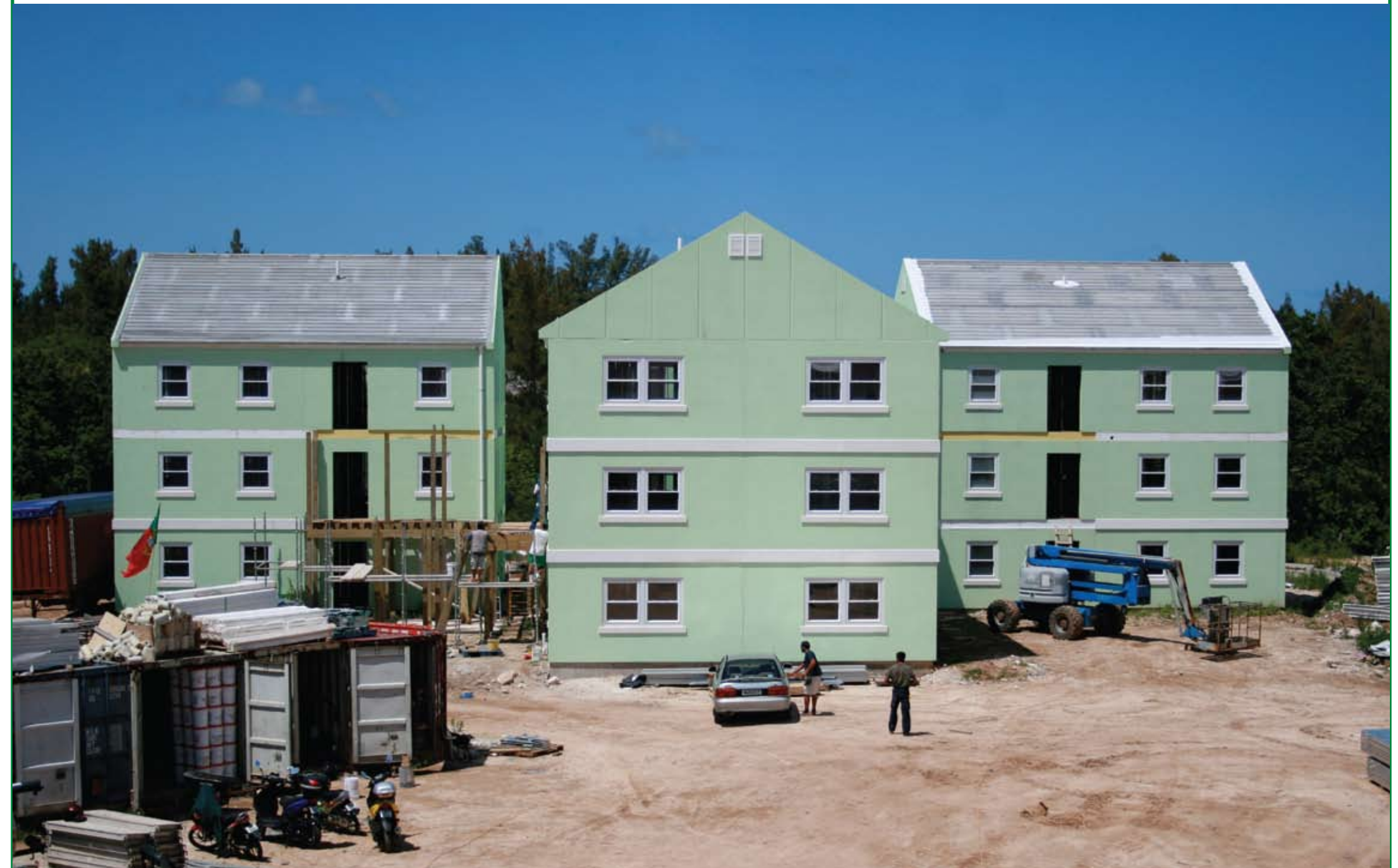
Rockaway Senior Housing Project in various stages of construction